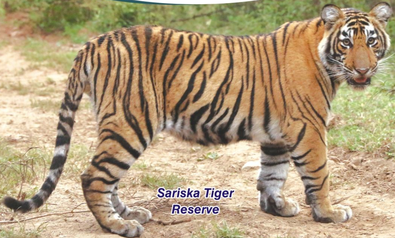
Sariska Tiger Reserve

Flourishing green forests, lakes, wild life sanctuary, beautiful palaces, forts ... Alwar is simply a delight to the eyes. Enclosed within the Aravallis, the city appears as if being carved out of rocks. Architectural wonders dot the city and mesmerizes you by their beauty and charm. Alwar also offers to you the opportunity to explore the unique varieties of birds, animals and flora at the Sariska Tiger Reserve .